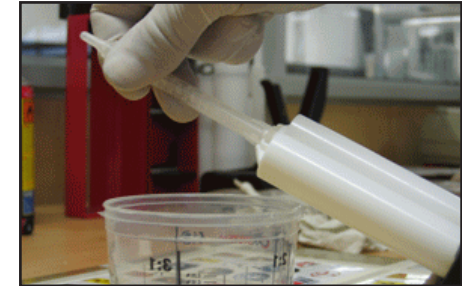
8 Now attached the static mixer to the cartridge. (This screws in)