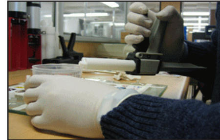
7 Squeeze the dispenser until both cylinders are ejecting resin.