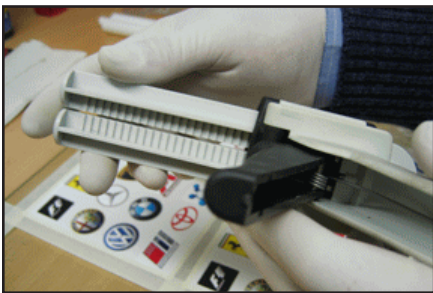
3 Place plunger into dispenser, ensuring serrated edge faces the handle.