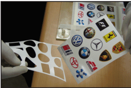
1 Weed your printed work to prepare it for doming.

NB: Please do not use plate glass! Glass is dangerous!!!