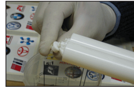
6 Gently break off the seal of the cartridge. Keep the seal in a safe place for resealing later.