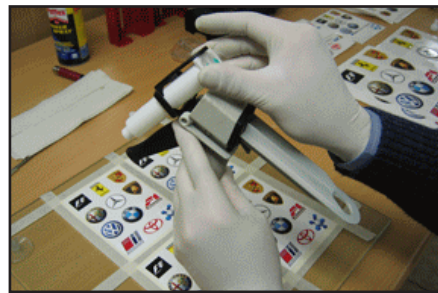
4 Place the cartridge into the dispensing gun.