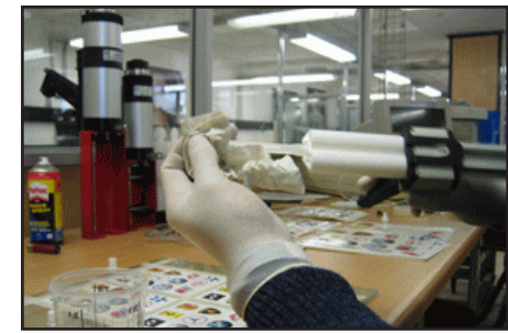
10 Wipe excess resin from the static mixer.