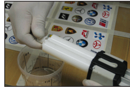
5 Remove the safety cap from the cartridge by turning 90° and gently pulling.