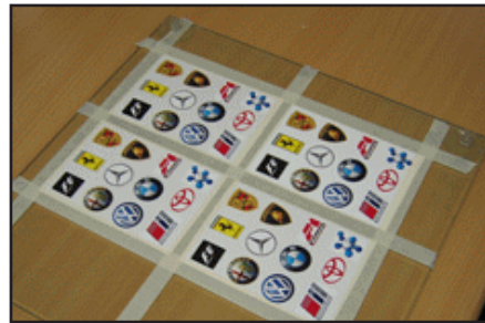
2 Lay your work on a flat glass sheet - use masking tape to secure.